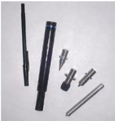
Use a Variety of Tools